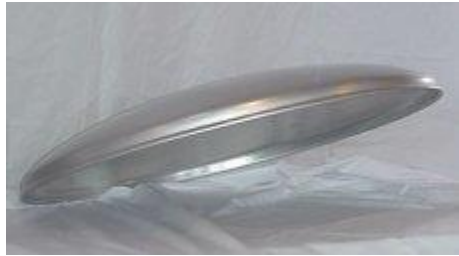
34 inch Patio Plus Reflector

Clearance to Combustibles Above Reflector 18" Beside Reflector 30" Below Reflector 30"