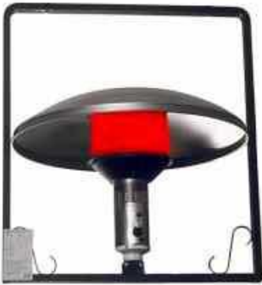
PH-45-H-LP (Propane) PH-50-H-N (Natural Gas)

Exclusive "No If's, And's, or But's" 4 year warranty.