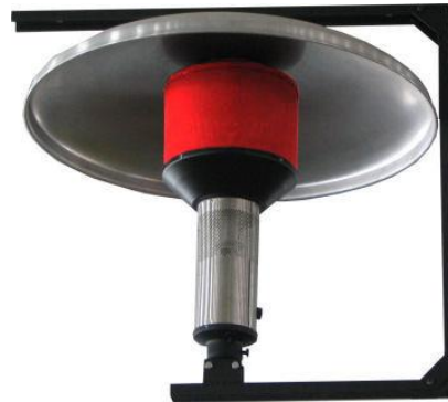
PH-45-HC-LP (Propane) and PH-50-HC-N (Natural Gas)